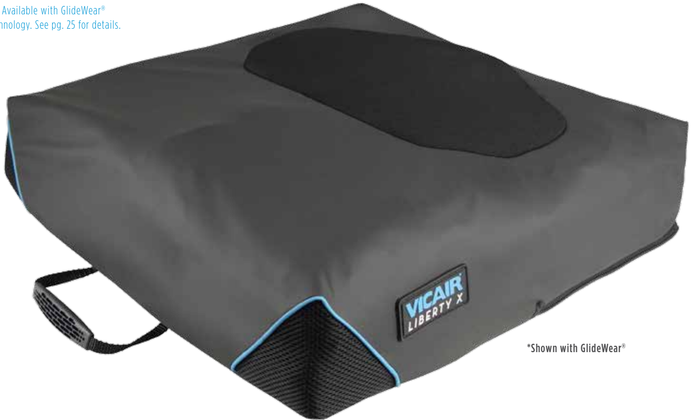
*Shown with GlideWear ®

Available with GlideWear ® Technology. See pg. 25 for details.